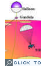
An overview of Global Aerospace's proposed DARE mission to Venus. Floating above Venus's surface, the balloon navigates using the StratoSail, while releasing its payload of probes.